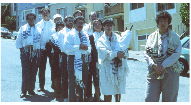
SZ members carry the Torah at the dedication of our first synagogue on Danvers Street

But these files are only as good as our ability