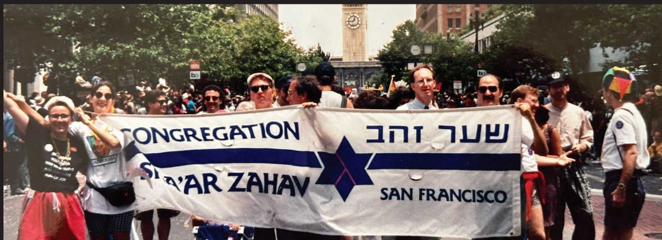
Sha'ar Zahav contingent in the 1992 Pride Parade.

See all our events at shaarzahav.org/pride and watch the weekly email.